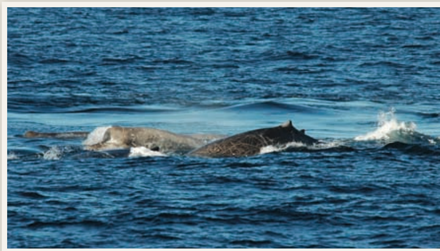
Above – A pod of Arnoux's beaked whales in Doubtful Sound Above right – An elephant seal in Preservation Inlet

Another visitor that returned to the fiords was a Southern elephant seal, who spent a lot of time 'hanging out' in Preservation Inlet. It's not known if it's the same seal seen in 2009, but wardens at Kisbee Lodge reported that it was around for a number of weeks, before finally heading away. The sheer size of this species of seal is really something to behold!