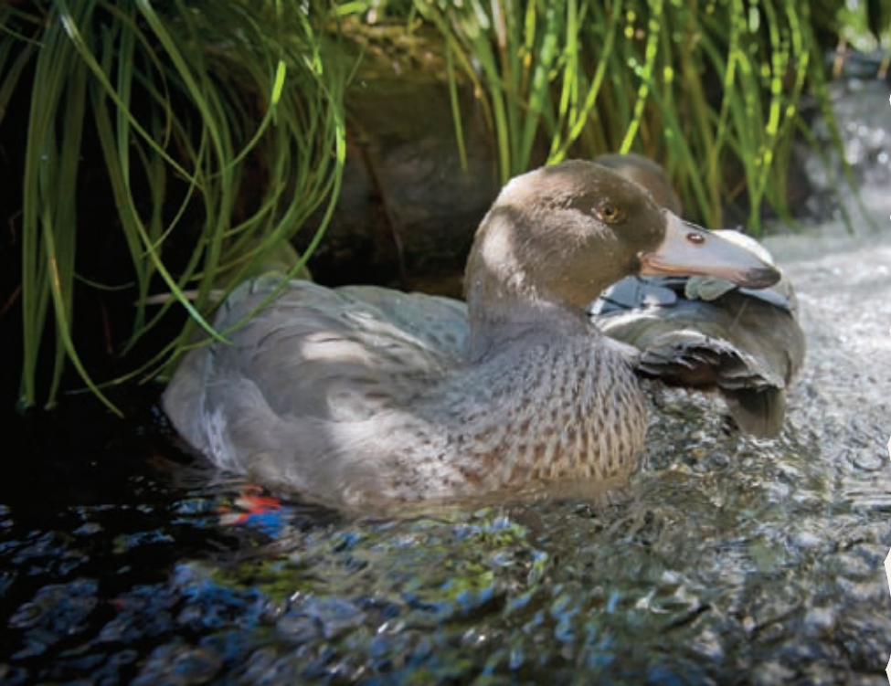
Whio (blue duck). (Graeme Dainty)