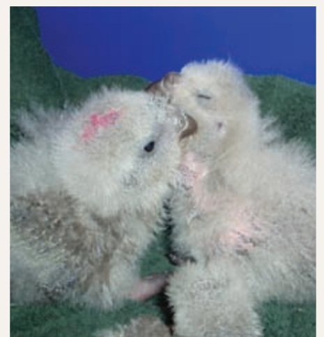
Kakapo chicks in the hand-rearing unit. (DOC)

Meanwhile on Codfish Island (Whenua Hou), the drop in rimu fruit numbers was not enough to deter eight females from nesting. The season is currently going well, with 11 chicks being raised, both in the wild by their mothers and by hand by the kakapo recovery team. This brings the total population to 131 birds.